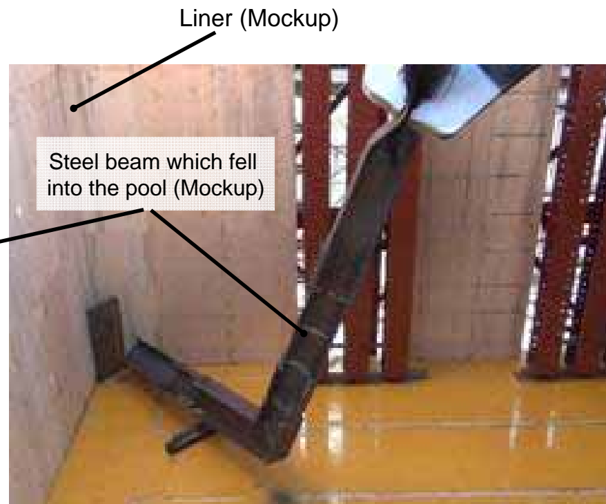
Mockup test (Steel beam being grabbed)