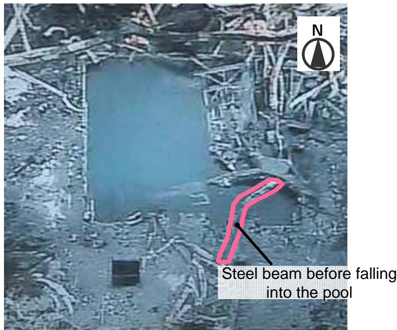
Location of the steel beam (Photo taken on September 22, 2012)

The steel beam removal is scheduled on December 20. (The schedule is subject to change depending on the weather and site conditions.)