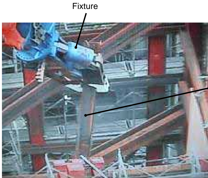
Mockup test (Steel beam being hung)

The test results were incorporated into the steel beam removal procedure used in the training.